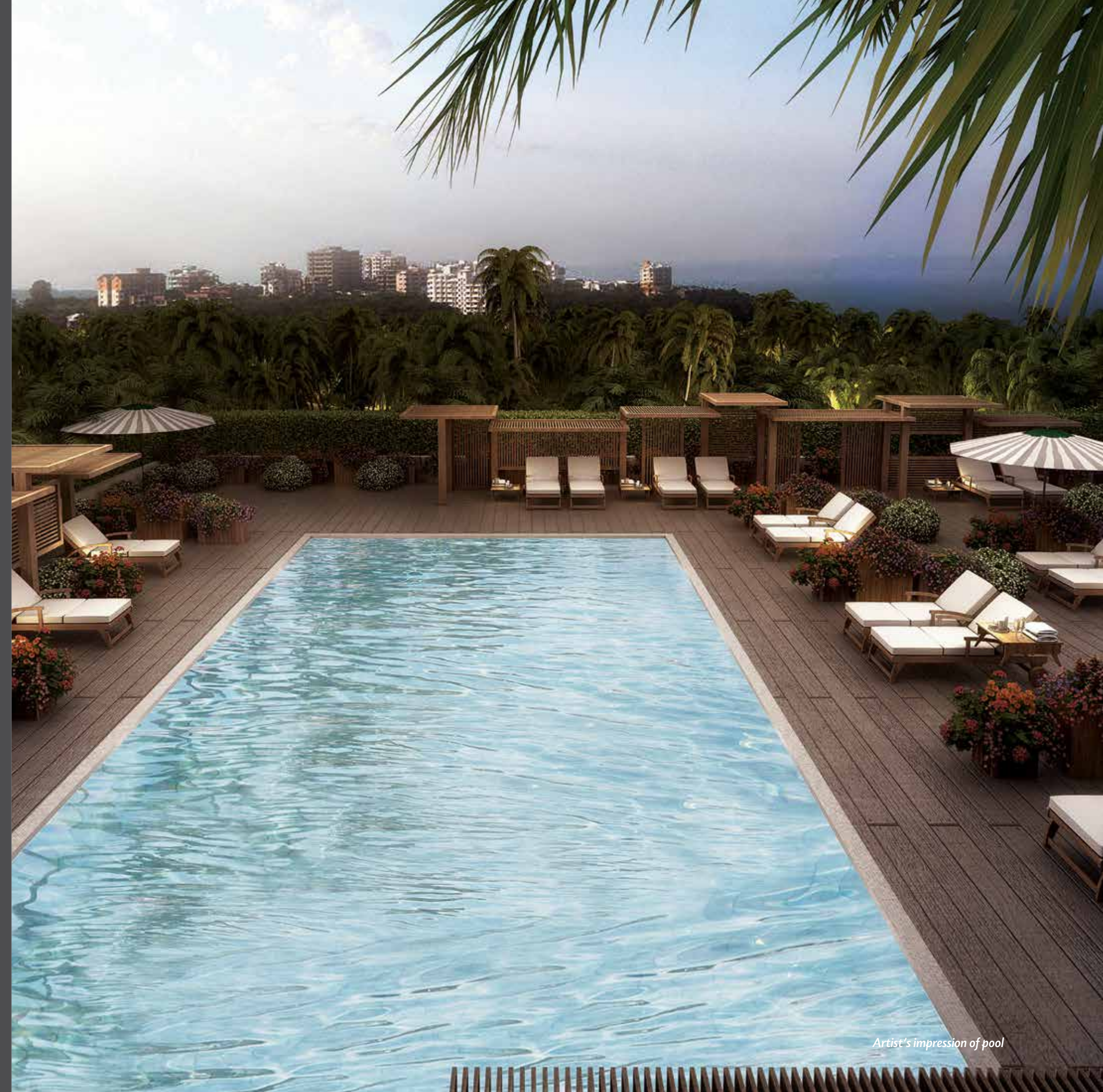
Artist's impression of pool

Indulge in your favourite recreational activities within your exclusive and private surroundings. Look good, and feel fit with your very own gym complete with state of the art fitness equipment. The outdoor yoga deck is perfect for the days you want to indulge in a lighter routine. Spend a lazy afternoon in the indoor recreation room. Your very own swimming pool awaits you, complete with a shaded deck. Dive into it with your whole family, and enjoy refreshing days.